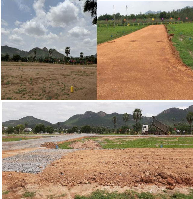
Figure 2: Location of the study area

The location is very near to capital city of Andhra Pradesh as well as very much easy and near to connect Hyderabad – Guntur and Kurnool - Guntur junction.