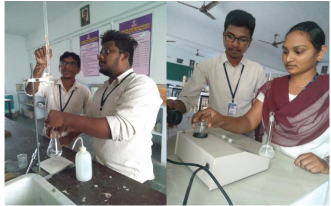
Figure 3: Sample collection and analysis