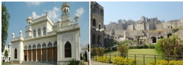
Fig 1.4 Nizam's of Hyderabad

Nizam's of Hyderabad: Nizam's of Hyderabad followed indo-islamic architectural style. Due to this Hyderabad is contemplated to be a heritage city. They had built many mosques and palaces during their ruling period. Most of the historical sites were built during the governance of qutb shahi and asaf jahi. Chowmahalla palace, gulzar houz are famous monuments built by Nizams of Hyderabad.