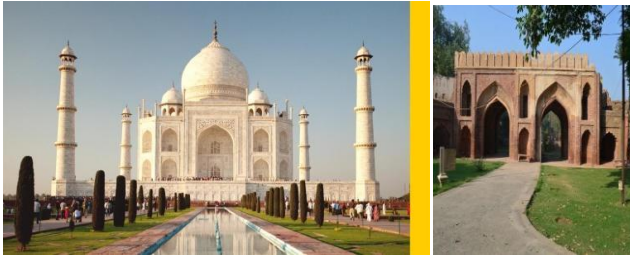
Fig 1.3 Mughal empire

Taj mahal, bibi ka maqbara, Kashmiri gate are few famous monuments of Mughal empire.