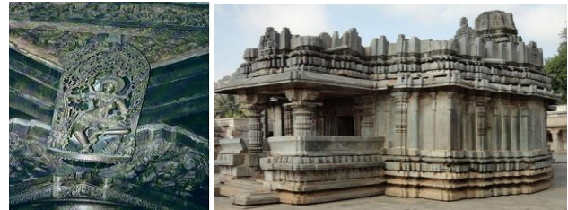
Fig 1.1 Hoysala Dynasty

Hoysala dynasty: Most of the hindu temple architecture was developed when the Hoysala empires were ruling. The Hoysala architecture follows Dravidian tradition of architecture style. They have their monuments built in different parts of the state. The basic building materials used by Hoysala empires are soapstone.