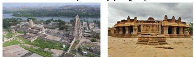
Fig 1.2 Vijayanagara empire

Vijayanagar empire: The Vijayanagara empire architecture is classified as religious, courtly and civic architecture. The architects also used plaster for giving finishing to the monuments. These materials were used due to their quality, durability, reliability etc. Vijaya vitthala temple, virupaksha temple, lotus mahal, hazara rama temple are few well known temples of Vijayanagara period.