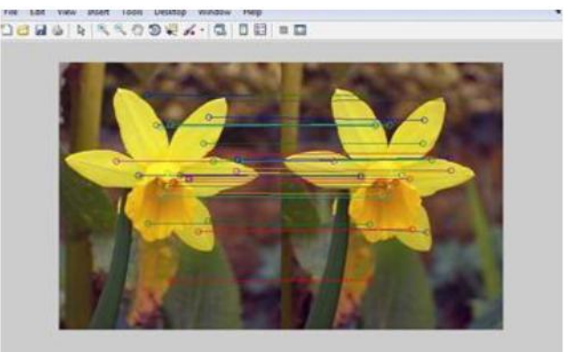
Output of the wrapped figure

It is a upgraded technique of SIFT. It uses approximate Gaussian second derivative mask to an image at varies scales. SURF is a fast technique, because of the procedure of an integral image where the assessment of a pixel (x,y) is the amount of all ethics in the rectangle defined by the source and (x,y). The foundation image can be found as the outcome of 4 operations. It facilitates a very little computing time, as it allows a rectangular mask of any size to be applied. To detect features, we assemble the Hessian matrix. The SURF descriptor is designed to be scale invariant and rotationally invariant. After generating feature descriptor, the dominant orientations of the area are rotated to the dominant orientation of the feature points. For analysis we used the functions SURF.detect(), SURF.compute() for finding keypoints and descriptors. 1199 keypoints is too much to show in a picture. We reduce it to some 50 to draw it on an image. While matching, we may need all those features, but not now. So we increase the Hessian Threshold. If we apply U-SURF, we won't find the orientation. All the orientations are shown in same direction. It is faster than the SIFT.