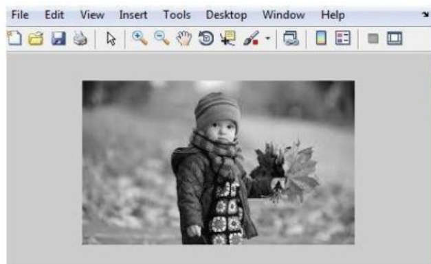
Gray scale Image