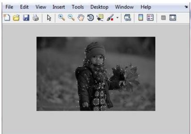
SIFT Feature Extracted