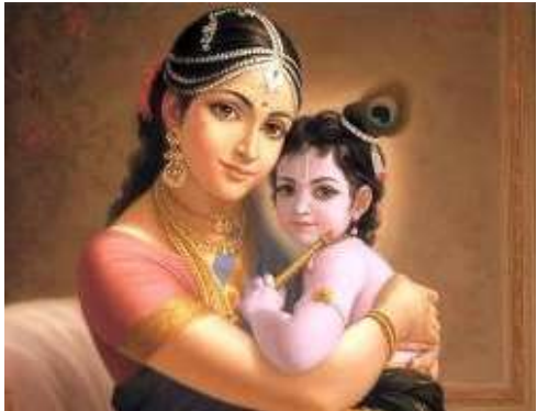
Fig.1 Original Image

Edge detection is the concept for a set of mathematical methods whose aim is to identify the points in a digital image at which the image brightness changes sharply or, more formally, has discontinuities. Edges typically occur on the boundary between 2 regions[2]. Edge is defined as the boundary pixels that connect two separate regions[3] with changing image amplitude attributes such as different constant luminance and tristimulus values in an image. Edge detection is a well developed field on its own within image processing. The main features can be extracted from the edges of an image which significantly reduce the amount of data to be processed while preserving the important structural properties of an image[1]. The example of an original image and image after edge detection are shown in Fig. 1 and Fig. 2 respectively below.