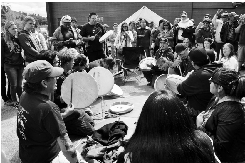
Figure 6.2 Hand games held at the Kwanlin Dun Cultural Center in Whitehorse in 2016 during the Adäka Festival.