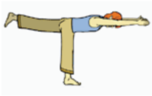
Fig. 1. Schematic view of the motor task

a marked area designated as the balancing area in this study. Participants then performed one trial as a pretest without any attentional focus instructions. Then, they engaged in the acquisition phase over five training blocks with each consisting of three minutes of training on the balance task. The participants were given a two-minute resting time between each training block. One day later, the children performed a one-trial retention test without any attentional focus instructions. In the pretest and the retention test, the children were instructed to balance as long as possible. In the external focus condition, the children were instructed to “focus on the yellow marker” that was placed two meters ahead of them on the ground. In the internal focus condition, the children were instructed to “focus on the right leg” while balancing. In the retention test, there were neither attentional focus instructions nor a yellow marker on the ground. To ensure that the children followed the focus instructions, we reminded them orally on how to focus at 10-second intervals during the training block. In order to measure the type and intensity of focus the participants applied, we had all children perform a manipulation check following the training phase. To determine the type of focus, we asked “what did you focus on?”, and to measure intensity of focus, we asked them to indicate on a Likert scale from 1 (not at all) to 7 (very much) “how much did you focus on it?”