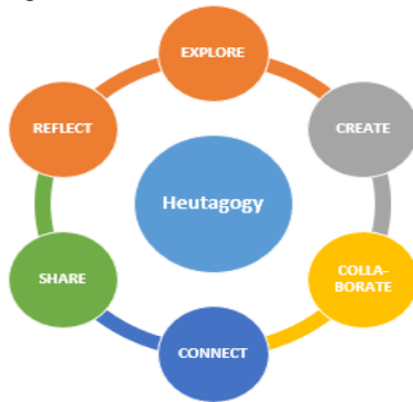
Fig. 2. The main components of the heutagogy model

The results and discussion in this study include three things. This is the component map on the heutagogy model, the percentage level of the heutagogy model component, and synchronizing the heutagogy model to the era of education 4.0. The results of this study indicate that there are six main components in the heutagogy model. These components are presented in Figure 2.