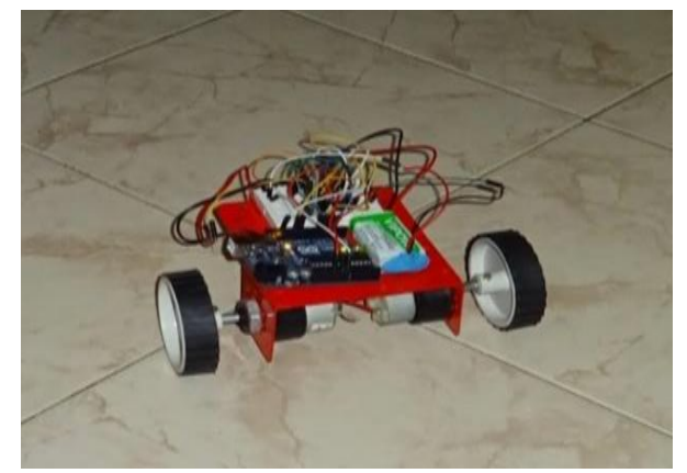
Fig.2 Working model of the Globally Controlled Robot

analytics and optimization methods have proven to be effective in various fields such as medical and all day to day activities, the performance of the globally controlled robot can be further improvised by incorporating these technologies [13-16].