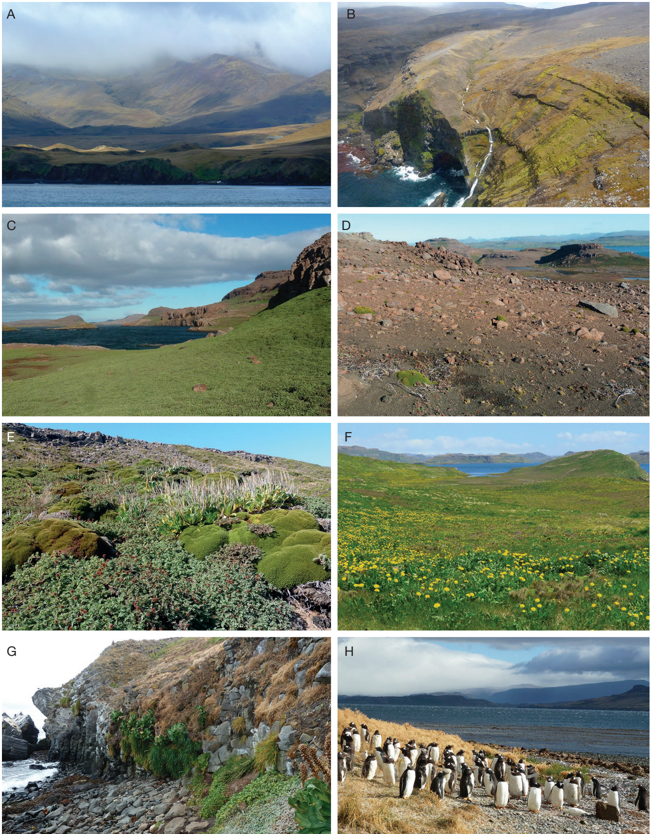
FIG. 2. — Some typical habitats of sub-Antarctic islands: A , wide open valley; B , wet coastal cliffs; C , slopes covered with Acaena magellanica ; D , fell field; E , native vegetation; F , introduced vegetation; G , coastal slopes and foreshore; H , marine animal colonies.