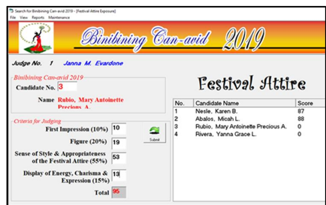
Fig. 3: Pageant Criteria Displayed on Screen for Immediate Scoring from the Judges

The system was developed and ensured its efficiency and user-friendliness. The use of the application requires user login for both admin and judges as shown in figure 2 above. The system contains different menus: File, View, Reports, and Maintenance. Under file menu are the sub-menu that includes the different events/exposure of the pageant. View sub-menu are different forms wherein admin can easily monitor scores of the current event/exposure. Report sub-menu includes printing of result. Maintenance sub-menu includes judges' registration and candidates' registration.