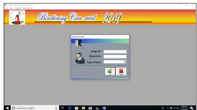
Fig. 2: System Login Form

A pageant tabulation system was developed using Visual Basic. One of the greatest advantages of this software is that its structure is simple, especially the executable code, user friendly and interactive. It has also an integrated development environment (IDE) with easy-to-use tools and utilities that allows for rapid development of software programs.