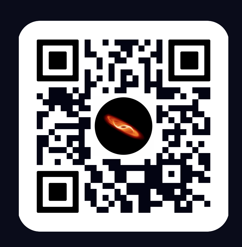
Scan or click here for more details with animations!

AIM — Can warps suppress gravitational instabilities in massive discs so that they are more in line with observations?