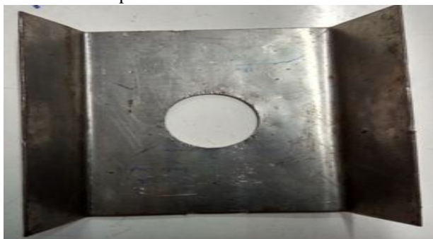
Figure 1.5: Tapered Plate Chamber

1.1.4 Characteristics of Tapered Plate Chamber- Fourth chamber contain a plate of mild steel with size of 170 * 230 mm. The plate is tapered at 47.5 mm from both sides at an angle of 60 degree approx and having diameter of 76.2 mm. Thickness of the plate is 1.63 mm.