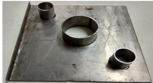
Figure1.7: Diagonal Plate Chamber

arranged diagonally. The length of all three pipes is 30 mm and diameter of center pipe is 50.8mm while diameter of both corner side pipes is 25.4 mm. Thickness of the pipe is 1.02 mm. Material used for plate is Mild Steel and for pipe is Stainless Steel 204.