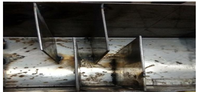
Figure 1.8: Zigzag Plate Chamber

1.1.7 Characteristics of Zigzag Plate Chamber- Seventh chamber contains zigzag plates of size 170*100 mm each. Thickness of the plate is 1.63mm. Material used for plate is Mild Steel.