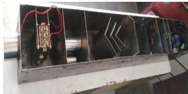
Figure 1.1 : Acoustic Model

For conducting the experiment, rectangular acoustic tunnel with seven chambers has been designed and fabricated which is given in Figure 1.1. This consists of seven chambers with different material and specification to reduce the sound level. Specification of tunnel is 1219.2*177.8*177.8 mm Which is fitted with force draught fan at outlet to supply air which passes through hot chamber. This acoustic tunnel is divided into seven different chambers.