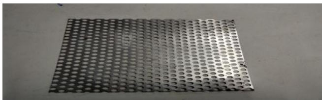
Figure 1.6 : Net Chamber

1.1.5 Characteristics of Net Chamber- Fifth chamber contains a net of 170 *170 mm. Material used is mild steel and hole size is 6mm and thickness of 1.63mm.