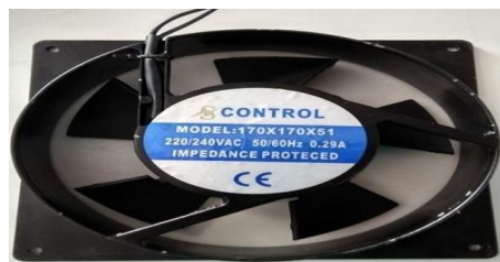
Figure 1.9: Silencer Fan

1.1.8 Characteristics of Fan- In our design we have used a fan operating at 220V, 50 Hz AC and 0.29A. Size of the Fan is 170 * 170 *50 mm.