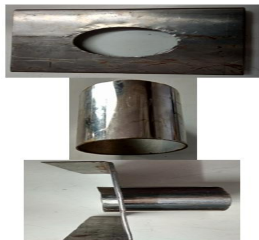
Figure 1.2 : Hot Chamber

1.1.1 Hot Chamber- Chamber one contains a plates of mild steel of size 170*170 mm with a long pipe attached at center of 55mm length and 76.2mm diameter with another short pipe attached with center of 27.5mm length and 38.1mm diameter. Material used for the plate is mild steel with thickness of 1.63mm.