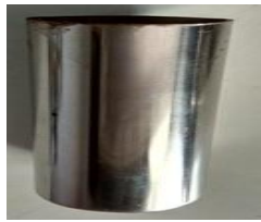
Figure 1.3: Cylindrical Pipe Chamber

1.1.2 Characteristics of Cylindrical Pipe Chamber- Second chamber consists of plates of mild steel of size 170mm * 170 mm. Both plates are separated at a distance of 110mm through a pipe of 50.8mm diameter at center. Corner pipe of length 70mm and 25.4mm diameter is attached at one of the plate.