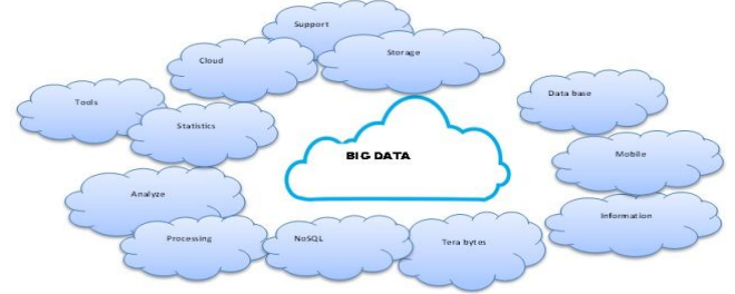
Fig. 1 Big Data [15]

The operations are performed parallel by Map Reduce framework. It processes huge sets of data in distributing environment [14]. This process of this framework is having two main phases such as Mapper and Reducer. In first phase, the huge data is fragmented into small chunks and input key value is attached to entire the data. Each data unit is sent to next phage. In the second phase, the received data from first phase as input is reduced the size of output and share the same key. The software tools are used to perform analytical process on data. The traditional data warehouses may not provide good service for unstructured data of Big Data analytics and may not handle high processing of Big Data on demand [15]. The Big Data Analytical software framework is core structure for processing the large sets of Big Data across the DFS and clustered systems [16]. The Big Data representation is depicted in Figure 1.