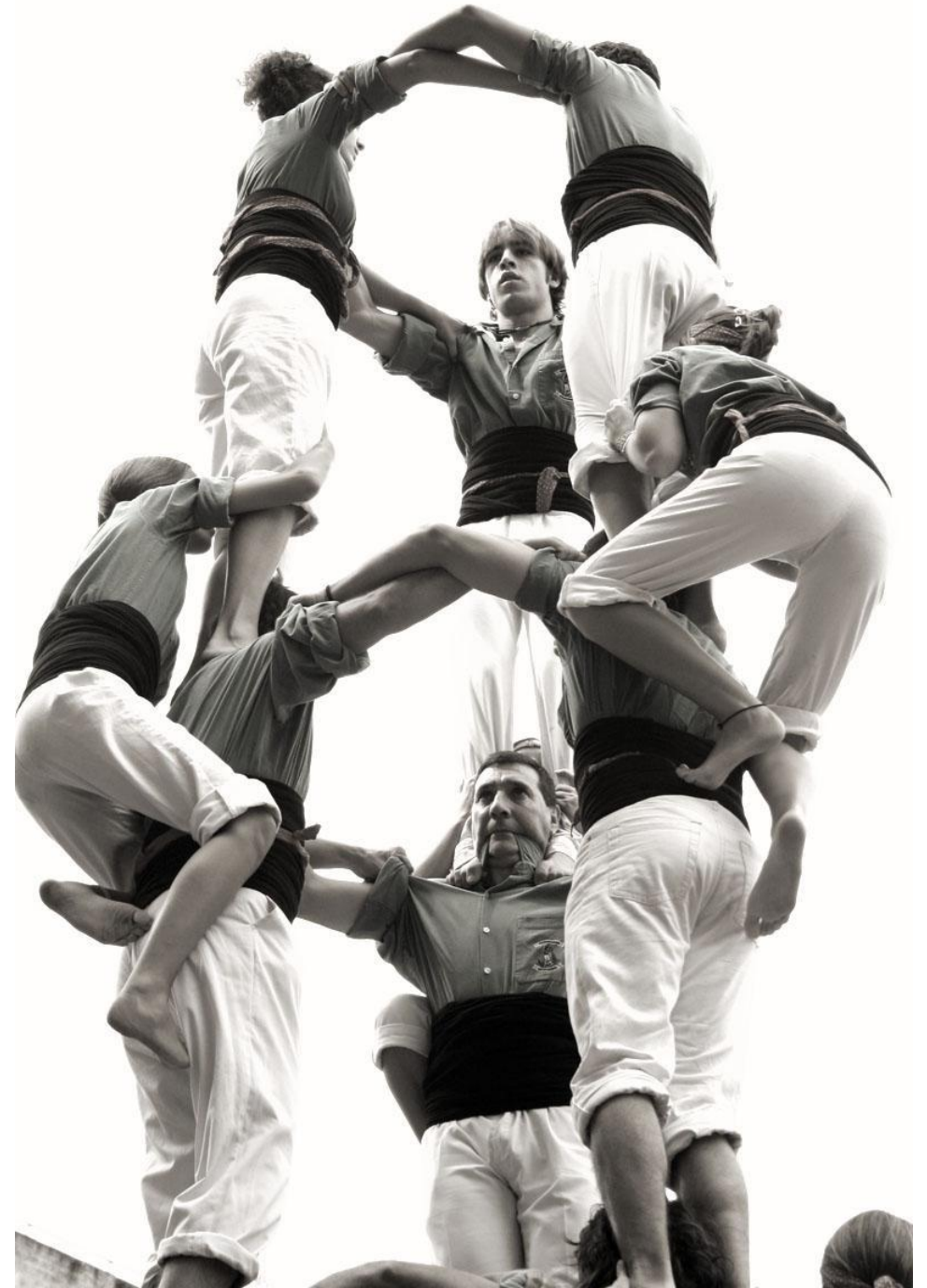
Image: Building a human tower