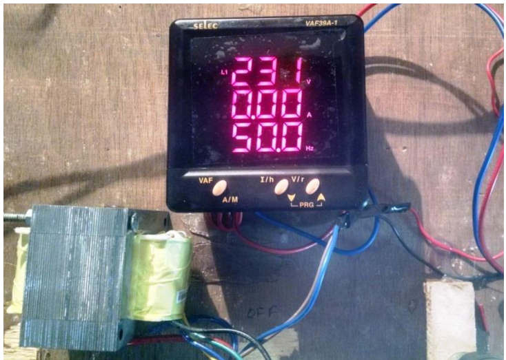
Figure 5: Display of Grid Power