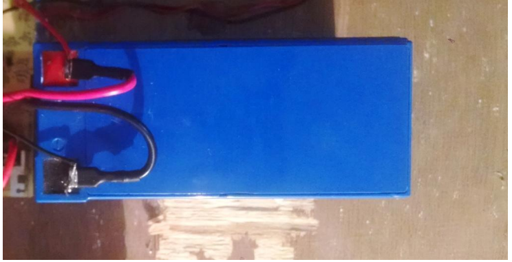
Figure 4: 12VDC battery