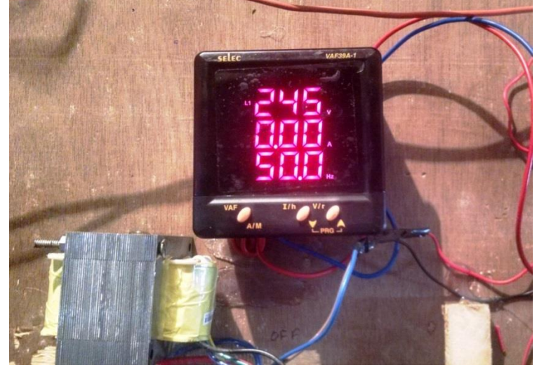
Figure 6: Display of Solar Power