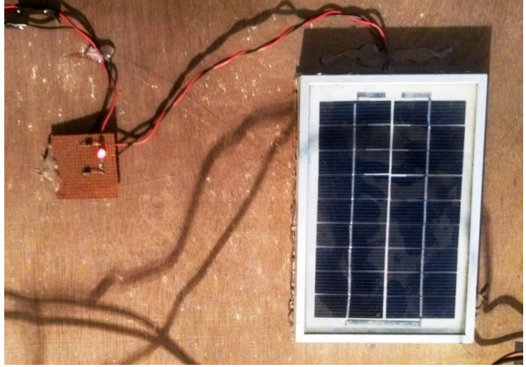
Figure 3: Photovoltaic cells with LED display