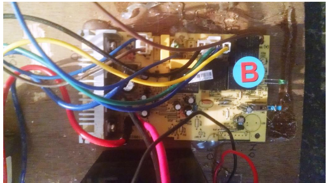
Figure 2: 12VDC to 220VAC Convertor