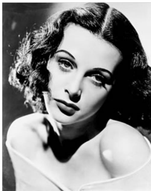
Figure 3: The photograph of the actress and inventress Hedwig Eva Maria Kiesler, also known as Hedy Lamarr. There is no caption in the original document. The photograph was provided by the courtesy of the American Physical Society - APS. APS News, June 2011 (Volume 20, Number 6).

According to the publicly available data, Herr Mandl became obsessed with Hedy Lamarr and wanted to meet her in person. Hedy was said to have adored Mandl's charming individuality and his fascinating personality, even though some gossip sources claimed that this attraction was partly due to Mandl's Brobdingnagian wealth. Clearly, Hedy's parents, both of whom were of Jewish descent, did not approve of this relationship, and ultimately, marriage.