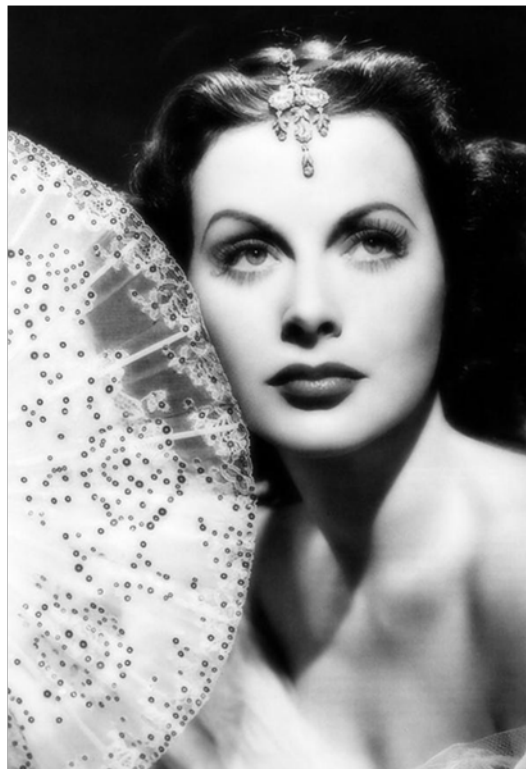
Figure 2: The photograph of the actress and inventress Hedwig Eva Maria Kiesler, also known as Hedy Lamarr. The caption from the original document contains the following text: "Hedy Lamarr."