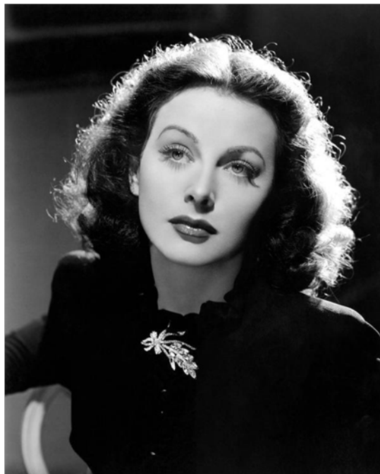
Figure 1: The photograph of the actress and inventress Hedwig Eva Maria Kiesler, also known as Hedy Lamarr. The caption from the original document contains the following text: "Actress and inventor Hedy Lamarr in the MGM film The Heavenly Body, 1944."

According to the publicly available records, Hedy Lamarr was born Hedwig Kiesler on 9 th November 1914, in Vienna. Hedy Lamarr died on 19 th January 2000. Lamarr's mother was Gertrude Lichtwitz, also known as Trude Lichtwitz, who came from a sophisticated family in Budapest, whilst Lamarr's father Emil was from Lemberg, Lwów, in the West Ukraine.