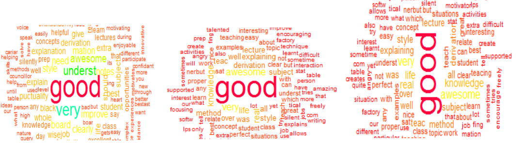
Fig.1: Word cloud of student's statements about teachers