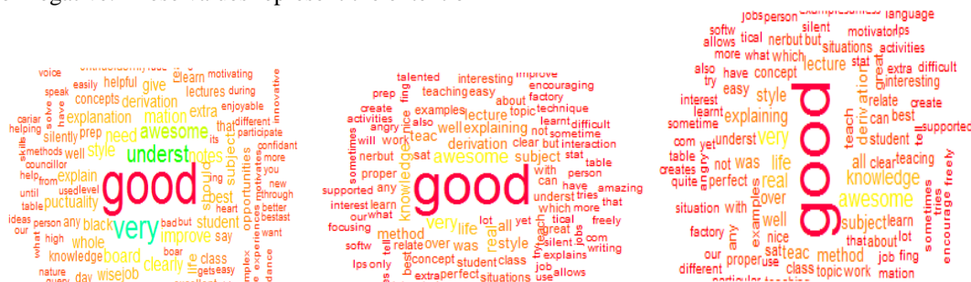
Fig.1: Word cloud of student's statements about teachers

To have preliminary idea about the sentiments of students they are represented in pictorial form. For example a specimen sample of three teachers with more than 50 feedbacks is represented by Fig.1 below in a word cloud form.