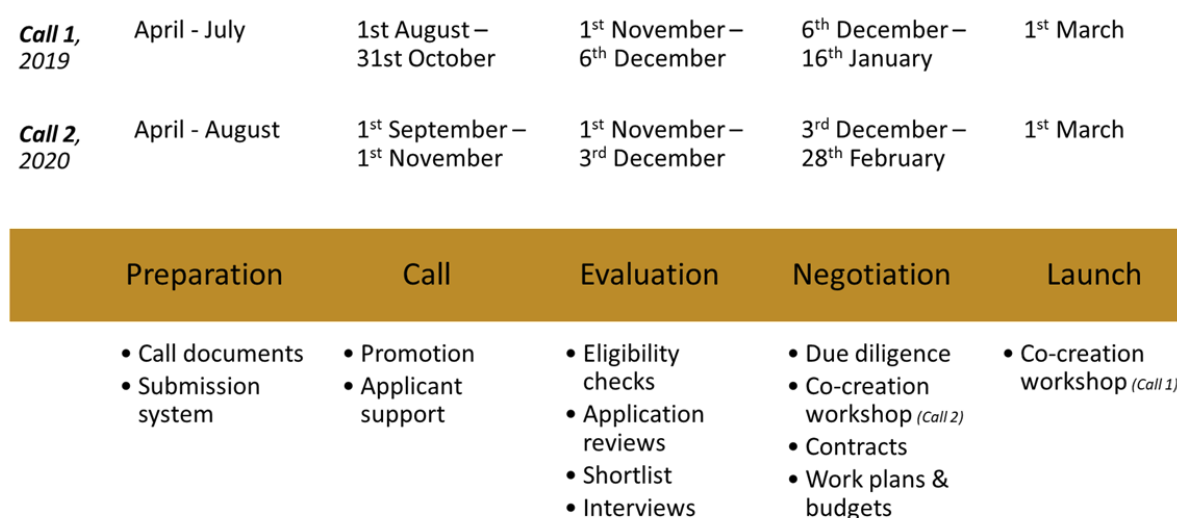
Figure 1- Summary of Call Stages

The ACTION open call is a competitive funding call intended to promote open innovation within European citizen science initiatives, with a particular focus on those initiatives researching and addressing pollution-related issues. Successful applicants gain access not only to funding, but also to an incubator process designed to take projects through the process of designing and implementing citizen science actions, gathering data and producing early outputs, over the course of a six month period. The call is divided into two rounds, each comprising five key phases: Preparation, Call, Evaluation, Negotiation, and Launch. Successful projects then join the 6 month ACTION accelerator and receive funding and ongoing support from the ACTION consortium.