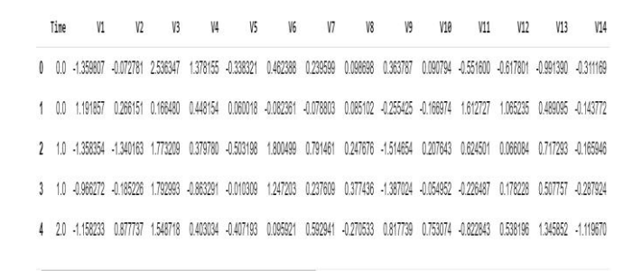
Fig 1: Analyzing the dataset

We evaluated the sample taken from Kaggle in this paper [2]. The report is in CSV type (creditcard.csv), it includes credit card purchases comprising 284,807 payments made by consumers in Europe throughout Sept 2013. Credit card purchases are defined by tracking the purchase activity into two types: fraud and non-fraudulent purchases. According to security concerns original functionality and further context details are not included in the training data. The findings of the Principal Component Analysis (PCA) Conversion are given with only quantitative input variables. Traits V1, V2... V28 (Fig 1) are the main components obtained with PCA, only Time and Number are the properties not converted with PCA.