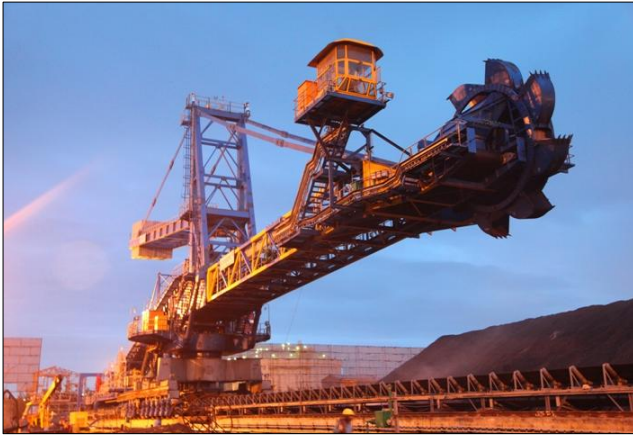
Fig.3: Stacker cum reclaimer