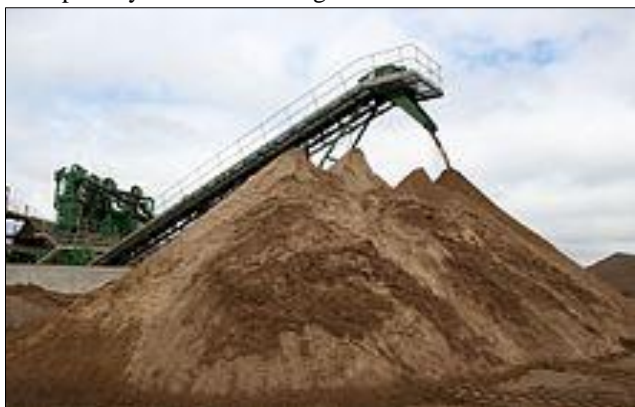
Fig. 1: stacking positions in yard

The dumping of cargo in yard, May sometime be uneven in storage forms, sometimes in increased conical configurations and sometimes un-stratified ways, due to rain and windy conditions the stockpile dimensions may get effected. Hence the study of stockpile before reclamation is important for safety of the equipment and human resource. Stockpile layouts and stacking methods