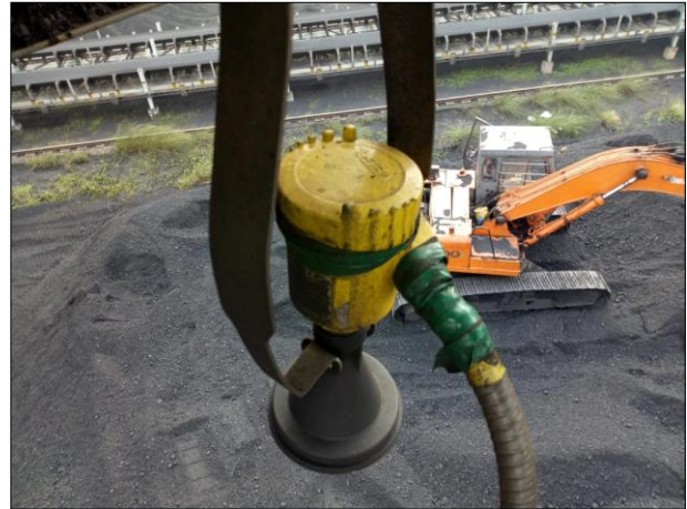
Fig. 4: stock pile sensor in GPL

Stock pile sensor implemented in Gangavaram Port Limited (GPL) by which boom fouling with yard stock piles reduced and choking of tripper car discharge chutes and transfer towers reduced drastically. The man power used for clearing the cargo in the chutes is reduced and optimal saving of time.