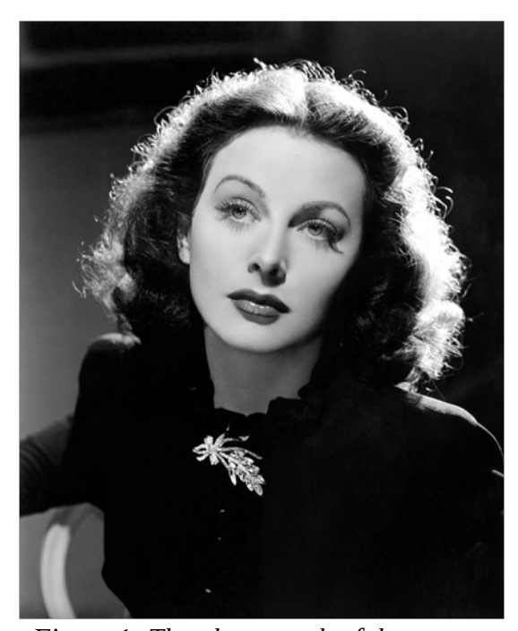
Figure 1: The photograph of the actress and inventress Hedwig Eva Maria Kiesler, also known as Hedy Lamarr. The caption from the original document contains the following text: "Actress and inventor Hedy Lamarr in the MGM film The Heavenly Body, 1944."

According to publicly available records, Hedy Lamarr was born Hedwig Kiesler on 9<sup>th</sup> November 1914, in Vienna. Hedy Lamarr died on 19<sup>th</sup> January 2000. Lamarr's mother was Gertrude Lichtwitz, also known as Trude Lichtwitz, who came from a sophisticated family in Budapest, whilst Lamarr's father Emil was from Lemberg, Lwów, in the West Ukraine.