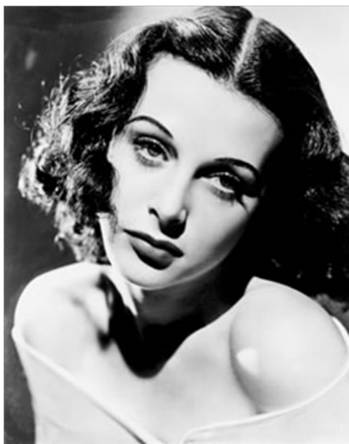
Figure 3: The photograph of the actress and inventress Hedwig Eva Maria Kiesler, also known as Hedy Lamarr. There is no caption in the original document. APS News, June 2011 (Volume 20, Number 6).