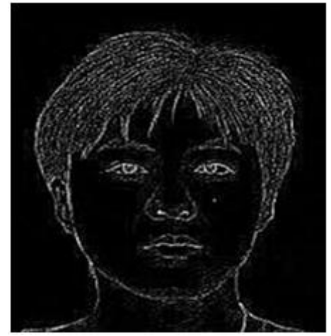
Fig 4.1 Sketch photo of the criminal

The unique image of criminal is sketched by using the size of eyes, ears and nostril. The various patterns and textures are implemented and among the different types of drawings the freehand drawing gives the better results. The absolute drawing of the criminal is obtained this method.