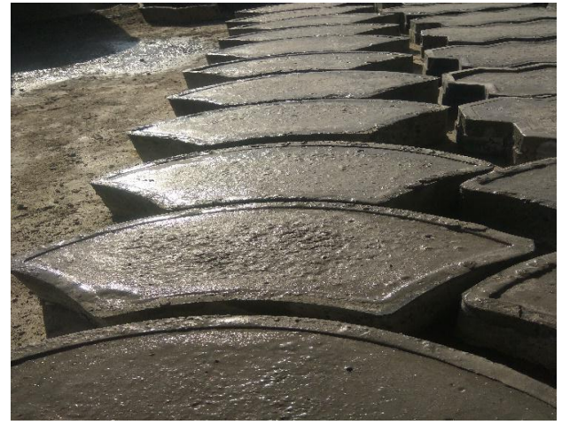
Fig 3. Paver block mould