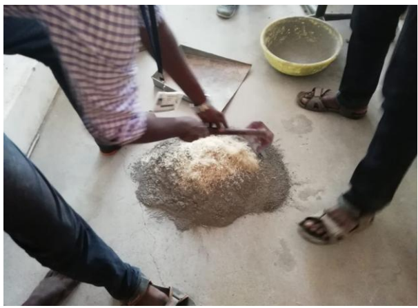
Fig 2. Concrete Mixing