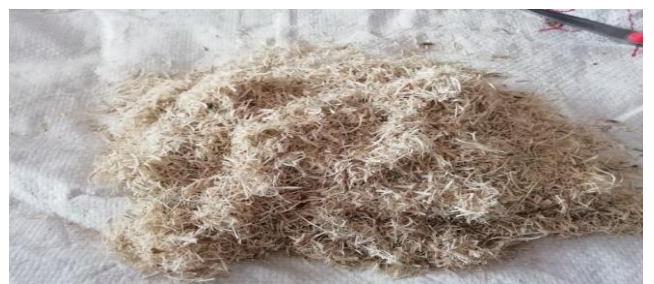
Fig 1. Sansevieria fiber

Published By: Blue Eyes Intelligence Engineering and Sciences Publication © Copyright: All rights reserved.