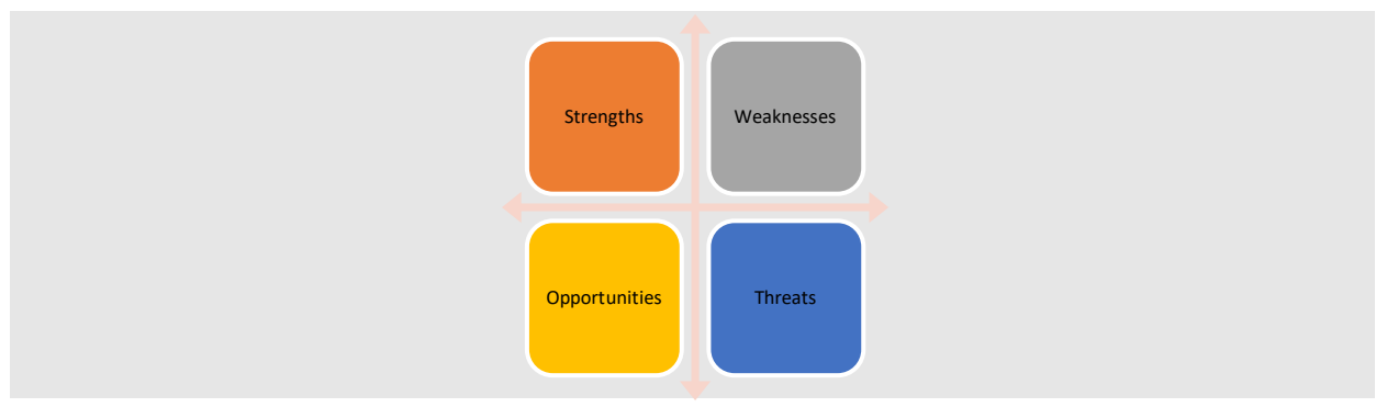
Fig 2: SWOT

This section looks at the strengths internal to the project (what we do well, resources we could draw on), weaknesses (what is lacking), opportunities outside the project (what could we make the most of; leveraging strengths) and threats (what is it that might harm us unless risks are mitigated) to SIENNA sustainability efforts. The initial identification was carried out in August 2020 by Trilateral Research, reviewed again in October 2020, brainstormed and discussed with SIENNA partners (a meeting was held on 18 November 2020, after which the information was updated).