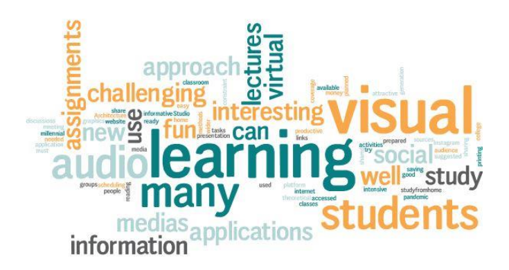
Figure 3. Frequency of word usage

Through the Word Cloud application, the frequency of words used in the respondents' additional comments can be generated as shown in Figure 3. Based on the Word Cloud, the terms most frequently mentioned by the students were learning, audio-visual media, information sharing, new approach, fun, challenging, and interesting. In general, the frequency of these words reflects positive feedback from millennial students about their experiences using social media as platforms for architectural learning.