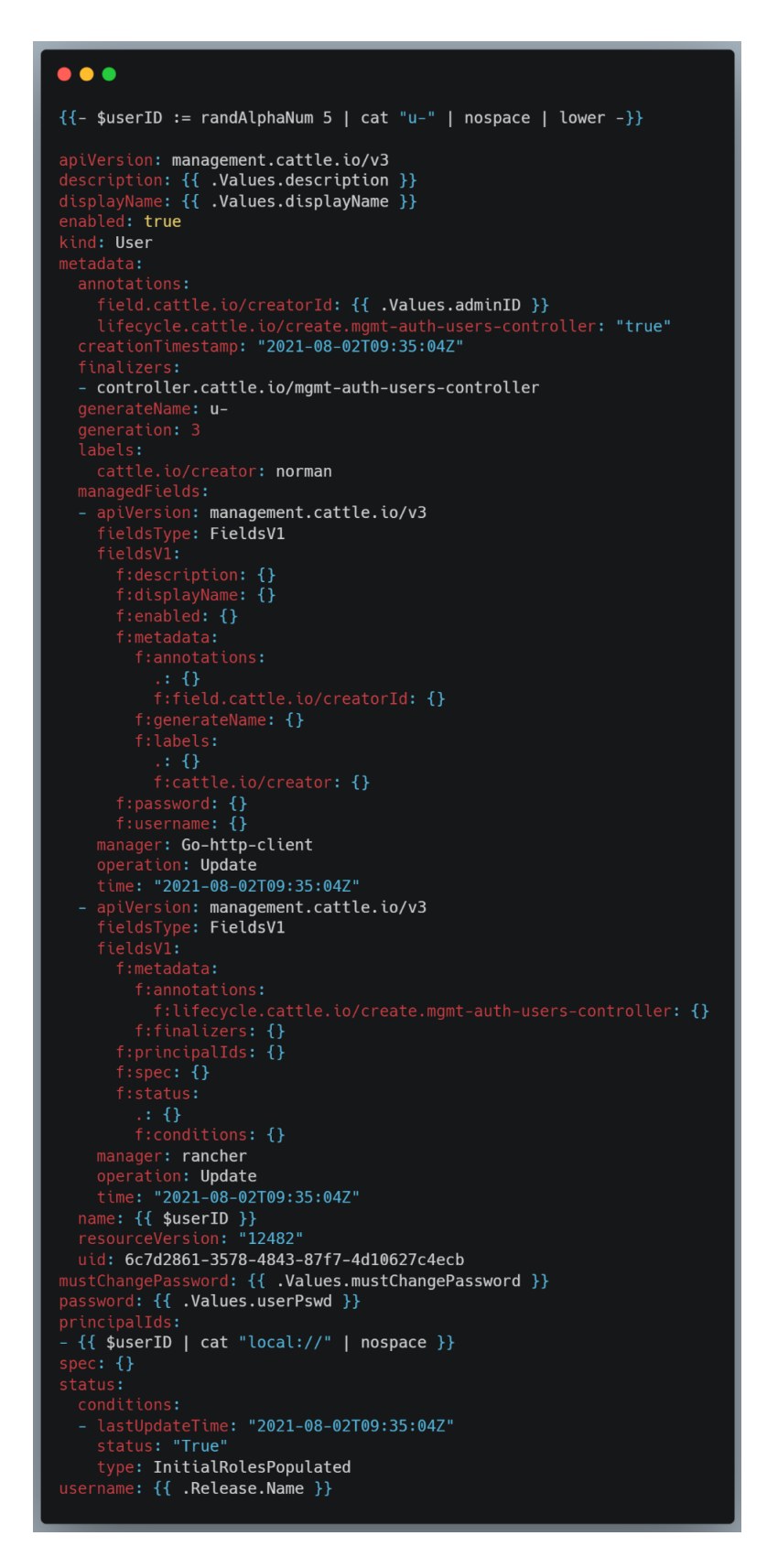
Figure 4. User template used in the local authentication schema.