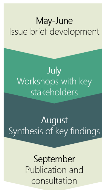
Figure 2: Key stages of our approach

In order to reduce the risk of inadvertently breaching competition law, all discussions took place in accordance with a 'Managing competition law risk statement', issued to participants prior to the workshops.