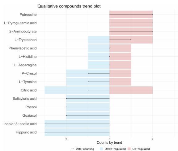
Fig. 2. Amanida explore plot. Vote-counting results plotted against total number of articles divided by trend. Data obtained from (Mallafre et al., 2021)

completely automatic manner using amanida_report function. To illustrate the package we have used a dataset from a urinary metabolomics meta-analysis study of colorectal cancer (Mallafre et al., 2021).