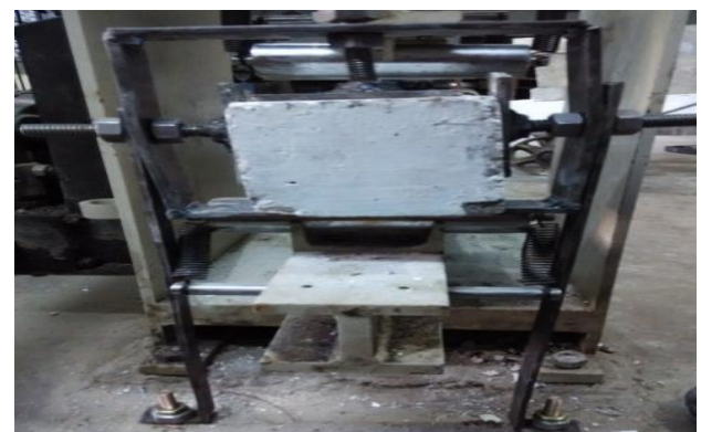
Figure 2. Set up of Clamp to Hold Far End