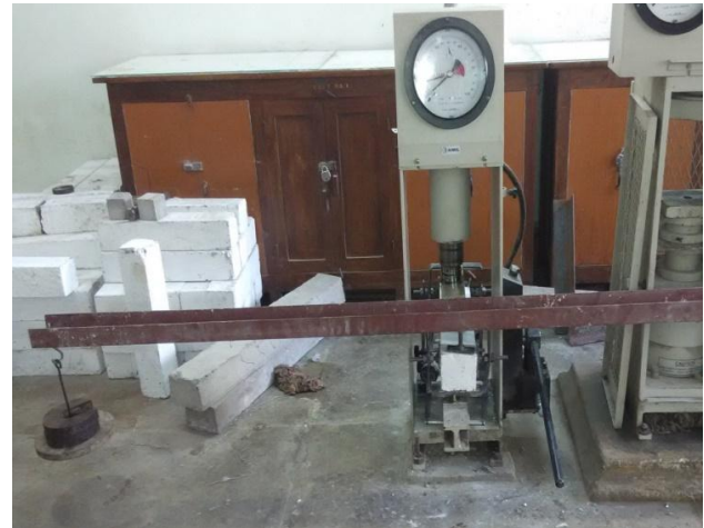
Figure 1. Set Up for Flexure, Torsion and Shear

The combined effect of flexure, torsion and shear was studied experimentally in the laboratory. Different type of experimental setup is required in which SFRC beams were tested in for flexure under two point loads. The central deflection was determined using dial gauges supported by a plate on both the sides. Pure bending was achieved by applying point loads exactly at 1/3 rd point of length from both sides with center of beam. The torsion was applied in such a way that a long iron girder was attached with one end of the beam and the other was clamped not to rotate. The arrangement of torque application is as shown in Figure 1 & 2. The torsion was applied as 0.0 N-m, 61.75 N-m, 119.41N-m and 176.53 N-m by varying the load on the iron girder.