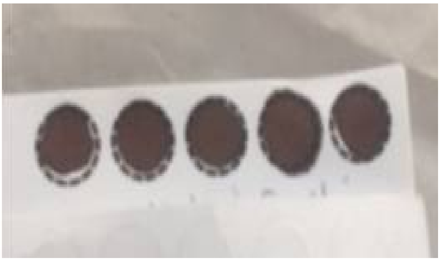
Figure 2:- Blood confetti for molecular analyses.