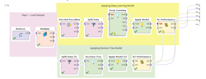
Figure 2. Final Grade Prediction Model Implementation in RapidMiner

categorical attributes and convert them into numerical ones based on the number of categories in each attribute. This step is not needed for the Decision Tree classifier as it can handle such values correctly.