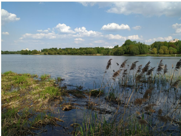
Figure 12. doi

Typical plant communities of the Tsaritsyno local flora (City of Moscow, Russia): reed communities (Phragmito-Magnocaricetea) on the bank of a water reservoir. Photo by the author (2019).