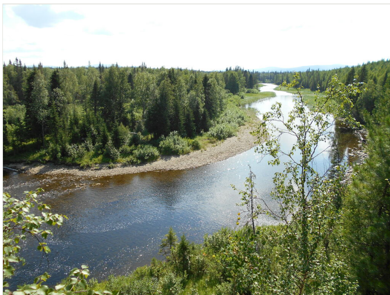
Figure 8. doi

Typical plant communities of the Middle Lyaga local flora (Komi Republic, Russia): river pebbles enframed by taiga forest ( Vaccinio-Piceetea ), 230 m a.s.l. Photo by the author (2013).