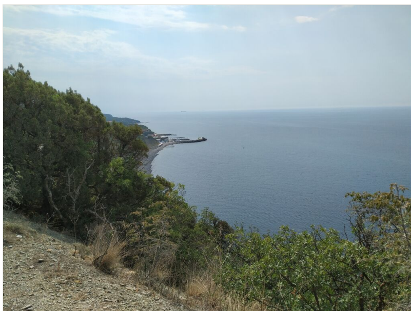
Figure 9. doi

Typical plant communities of the Middle Lyaga local flora (Komi Republic, Russia): river pebbles enframed by taiga forest ( Vaccinio-Piceetea ), 230 m a.s.l.