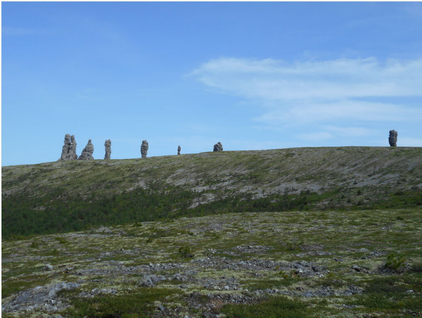
Figure 7. doi

Typical plant communities of the Troyeruchitsa local flora (Tver Oblast, Russia): taiga forest ( Vaccinio-Piceetea ).