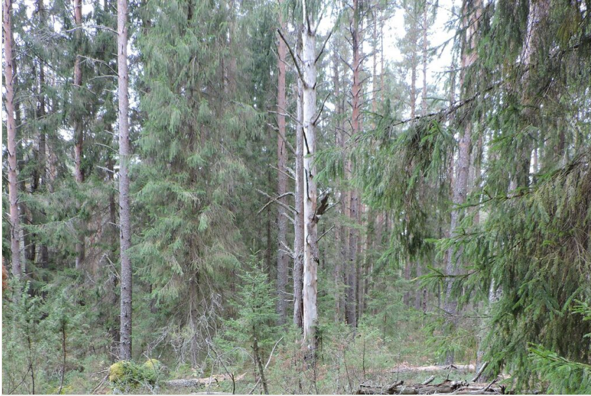
Figure 6. doi

Typical plant communities of the Troyeruchitsa local flora (Tver Oblast, Russia): taiga forest ( Vaccinio-Piceetea ).