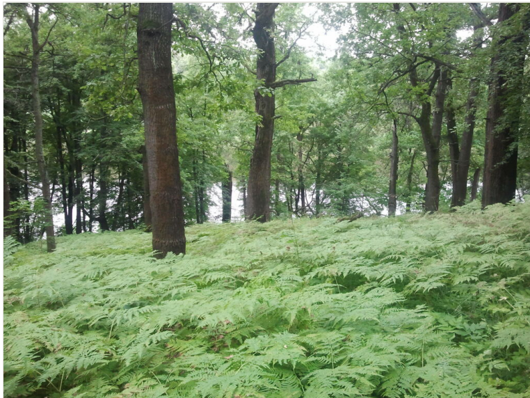
Figure 13. doi

Typical plant communities of the Tsaritsyno local flora (City of Moscow, Russia): reed communities (Phragmito-Magnocaricetea) on the bank of a water reservoir. Photo by the author (2019).