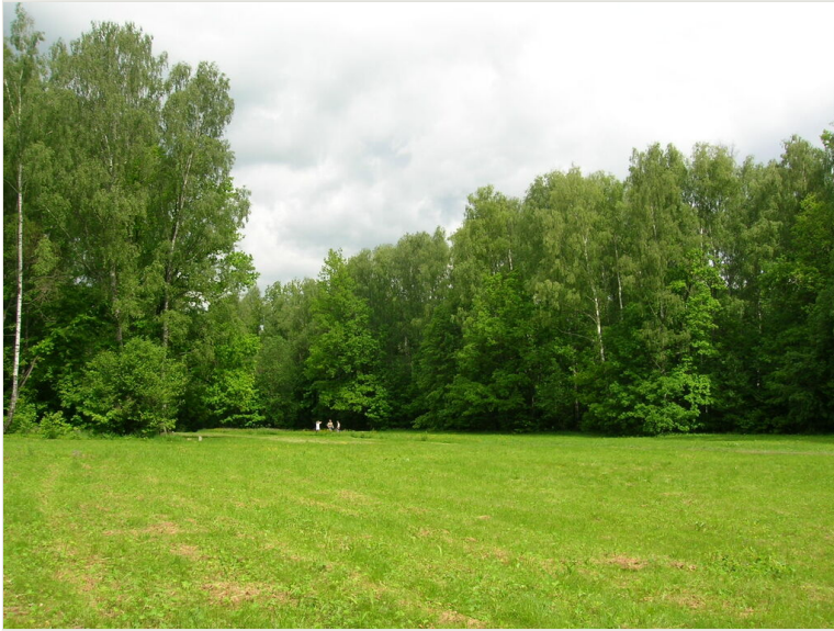
Figure 10. doi

Typical plant communities of the Yasnaya Polyana local flora (Tula Oblast, Russia): managed meadow ( Molinio-Arrhenatheretea ) on the edge of broadleaved forest ( Querc-Fagetea ).