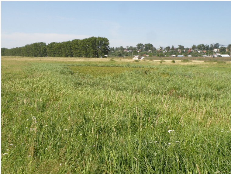
Figure 11. doi

Typical plant communities of the Yasnaya Polyana local flora (Tula Oblast, Russia): managed meadow ( Molinio-Arrhenatheretea ) on the edge of broadleaved forest ( Querc-Fagetea ).