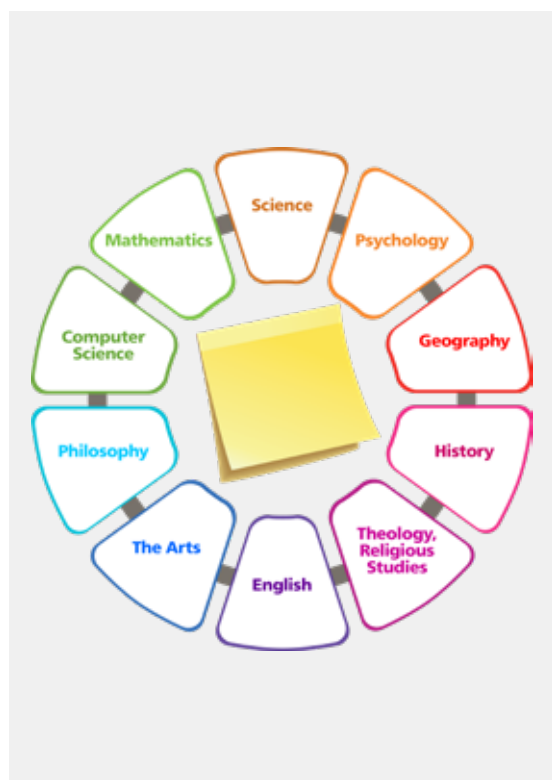
Original Discipline Wheel (LASAR, 2020)