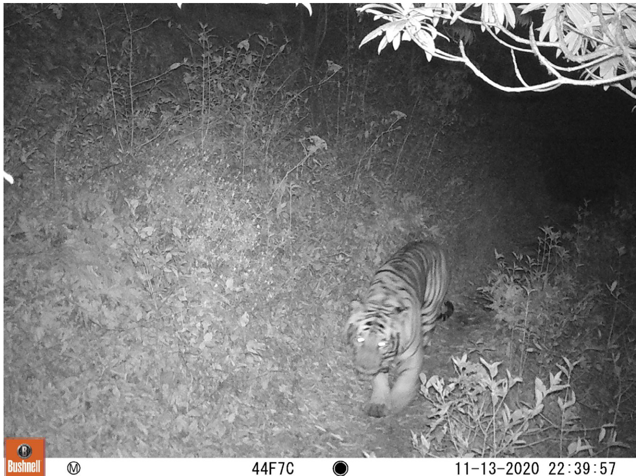
Figure 2. Panthera tigris tigris recorded in a trail camera in Ilam, eastern Nepal.

accessible habitat and proper management for increasing tiger populations may increase tiger mortality and aggravate human-wildlife conflict (Acharya et al. 2016). Such human-tiger conflict is on the rise in Nepal, as 10 human casualties and more than half a dozen human injuries were reported in nine months between July 2020 and April 2021 (NTNC 2021). These incidents indicate the need for a management plan for tigers and their habitat, as there is no tolerance of human casualties (Bhattarai and Fischer 2014).