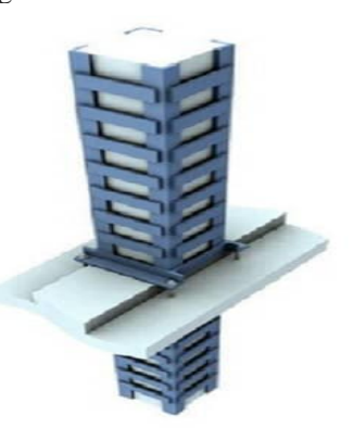
Steel Jacket Figure 1.1 Types of Jacketing