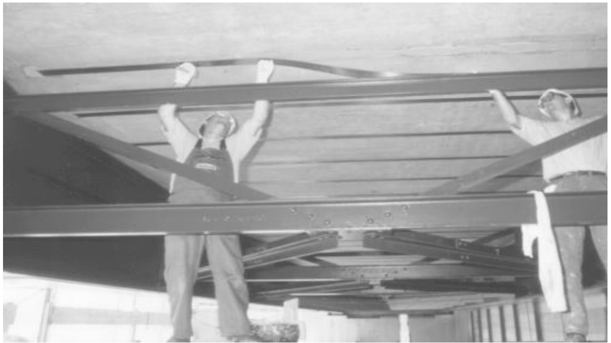
Figure 3.3: (b) Application of prefabricated strips.