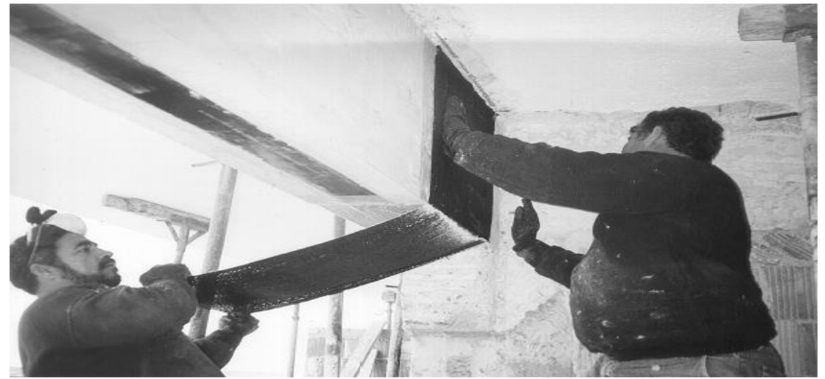
Figure 3.3: (a) Hand lay-up of CFRP sheets or fabrics.