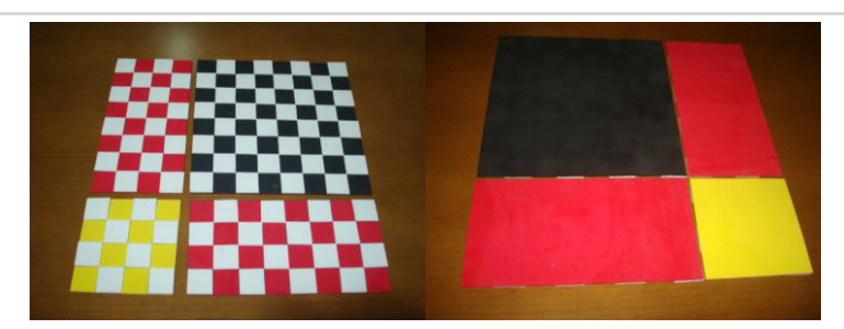
Figure I: Chess board adaptation