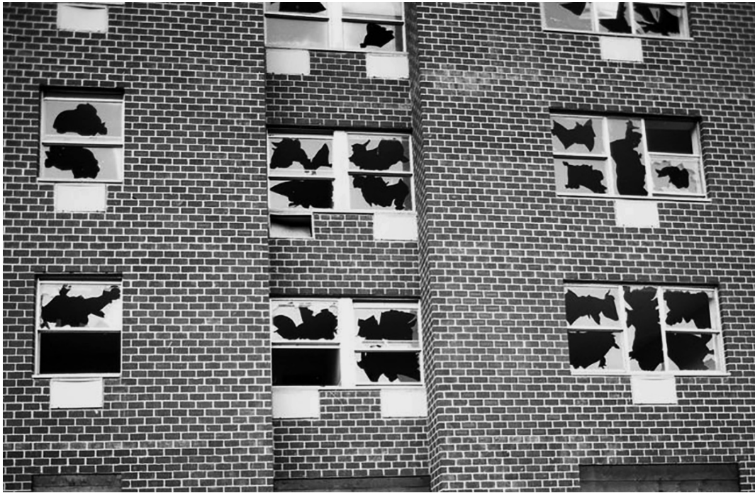
Figure 5. Gordon Matta-Clark, Window Blow-Out , 1976, photograph © 2019 Estate of Gordon Matta-Clark, New York.