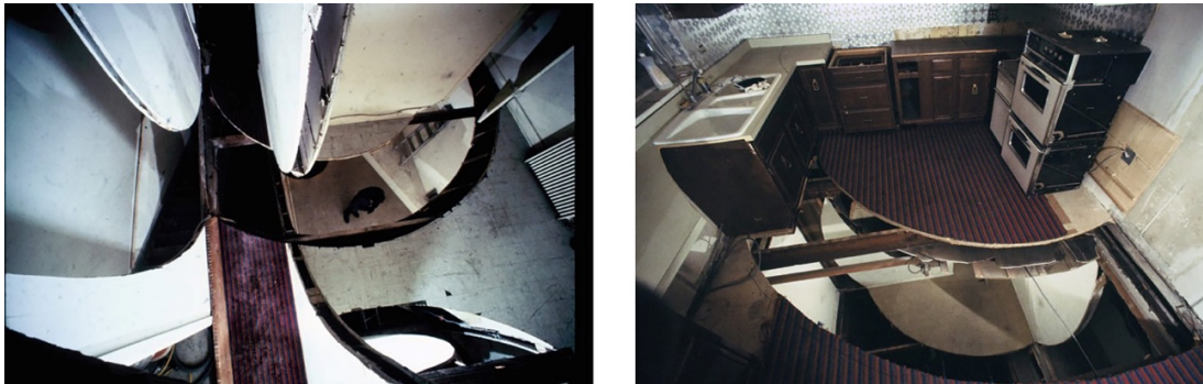
Figure 2. Gordon Matta-Clark, Circus , 1978, photographs © 2019 Estate of Gordon Matta-Clark, New York.