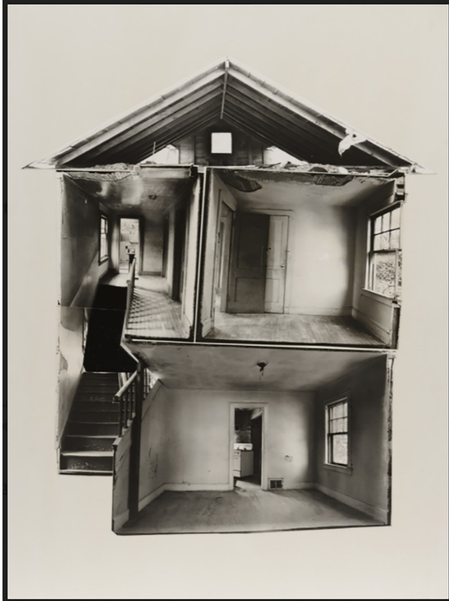
Figure 3. Gordon Matta-Clark, Splitting , 1974, collage of gelatin silver prints © 2021 Estate of Gordon Matta-Clark / Artists Rights Society (ARS), New York.