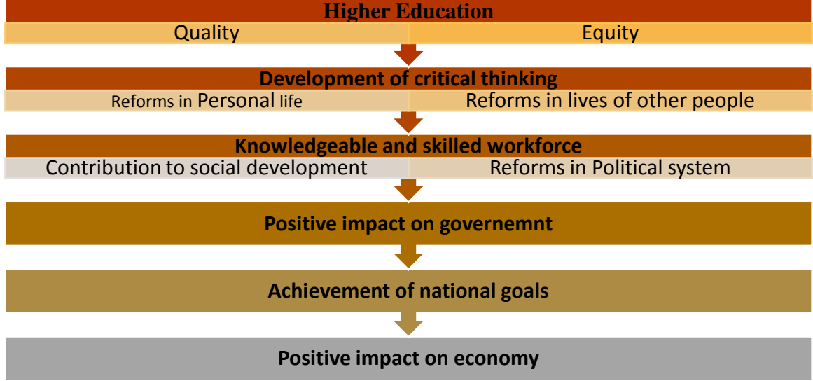
Fig. 1: A graphic presentation of the role of higher education on social, political, national, and economic development

The impact of higher education on political systems and governance has been long acknowledged. According to Grapragasem et al. (2014), higher education provides excellent opportunities for producing good policymakers who can influence the governance and decision-making capacities of a nation. Proper policies are derived by learned and knowledgeable individuals which contribute to government functioning and improving the political process of a country (Hillygus, 2005). Political participation of individuals and their awareness about the political system may serve as reforming agents in politics which adhere to higher education in many terms. Empirical studies suggest that higher education correlates with political participation (Persson, 2015). Higher education has also reshaped political opinions, changed the political culture and political democratization in many countries (Benavot, 1996; Bratton et al., 1999; Weakliem, 2002). In many studies and reviews, political competency, reforms, and sophistication has been interrelated to higher education and intellectual brainstorms which provide input to the political system for making it refine, democratic, and appropriate according to the needs of society (Benavot, 1996; McAllister, 1998; Dassonneville et al., 2012; Hooghe et al., 2015; Coleman, 2015).