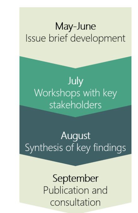
Figure 2: Key stages of our approach

In order to reduce the risk of inadvertently breaching competition law, all discussions took place in accordance with a 'Managing competition law risk statement', issued to participants prior to the workshops.