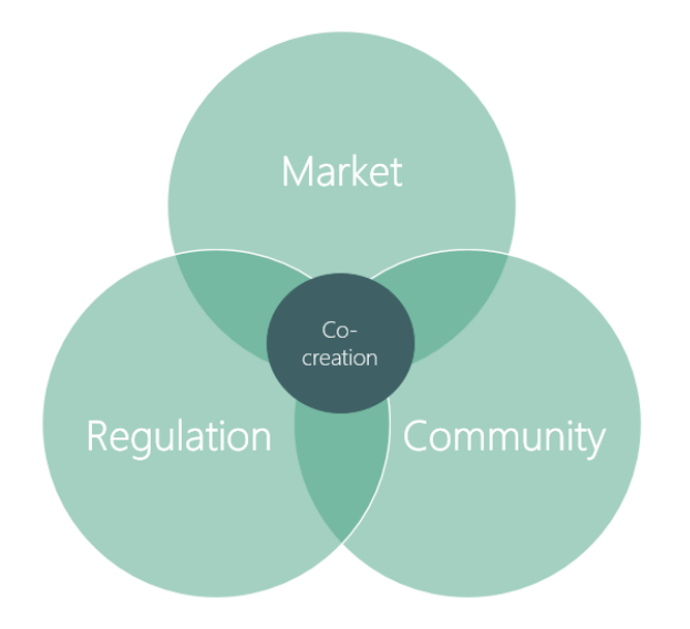
Figure 1: The three pillars of the OA market <sup>2</sup>

These three pillars, and the unifying concept of co-creation, were the foundational concepts explored via the workshops.