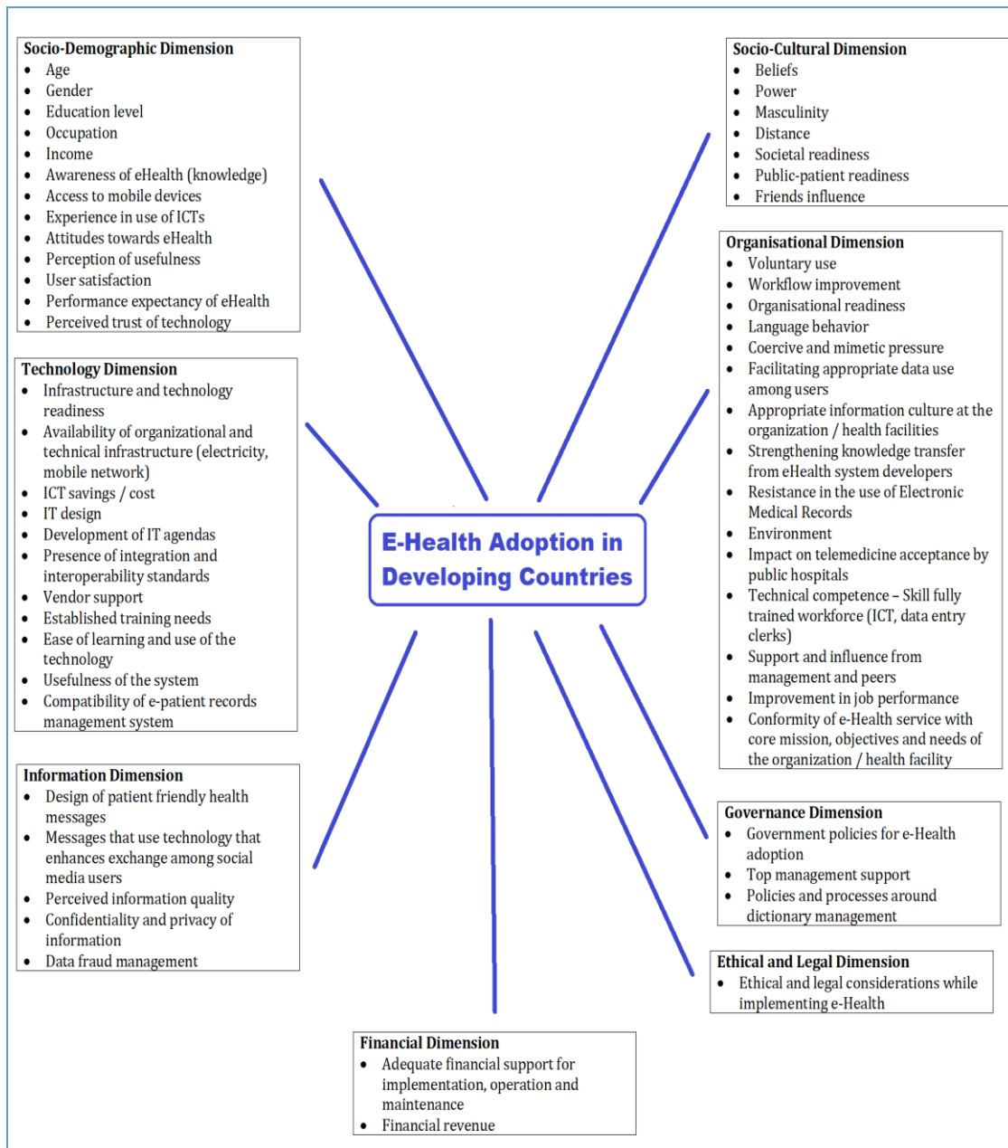
Figure 1: A Framework for eHealth Adoption in Developing Countries

Organisational Dimension: Successful eHealth adoption requires a conducive environment where there is adequate preparedness and readiness in the implementing organization / health facility. The implementation of eHealth should be in conformity with core mission, objectives and needs of the organization / health facility. There should be technical (ICT, data entry clerks) skill competence in the organization among the workforce as well as institutional and peer support/influence. Appropriate information culture at the eHealth implementing facilities and language behaviour enhances the adoption of technology. The use of coercive and mimetic pressure should be minimized and issues related to the resistance in the use of Electronic Medical Records (EMR) should be addressed while encouraging voluntary eHealth usage. The improvement of the workflows and job performance as well as strengthening knowledge transfer from eHealth system