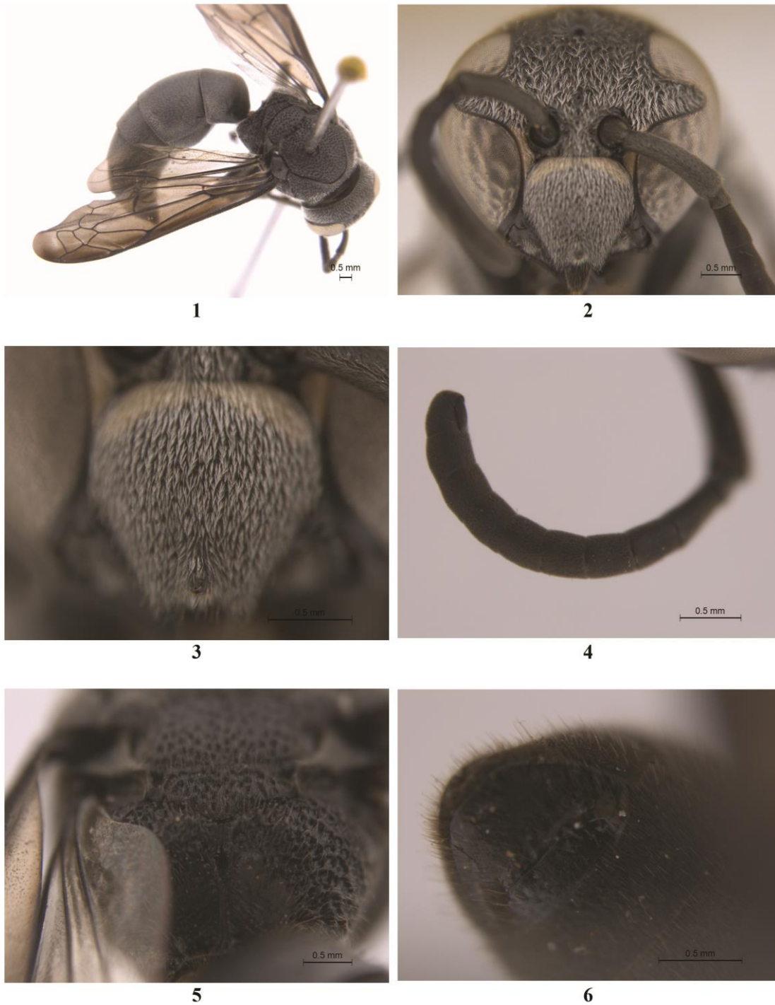
Figs. 1–6. Allorhynchium tuberculatum sp. nov. ♂. 1. Body profile; 2. Head frontal view; 3. Clypeus; 4. Antenna; 5. Metanotum and Propodeum; 6. Apical sternites.