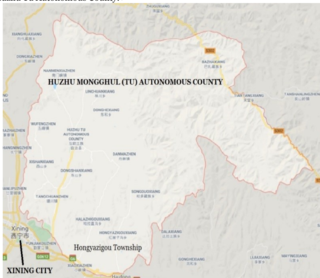
MAP 1. Huzhu Tu Autonomous County. 1