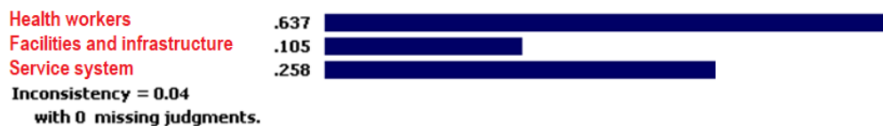
Fig. 2. Weight of Interest Between Criteria and Consistency Policy

Goal: Feasibility of Puskesmas based on Dempo Volcano Eruption Disaster Mitigation