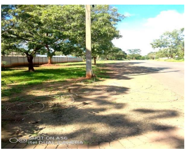
Fig 2 Unrecovered copper cables

The study discovered that there are so many copper cables lying idle from non-operational networks or circuitry. The theft of these cables is very difficult to determine unlike the operating networks which immediately impact on customers when service is discontinued. The majority of those serving at Harare Prison indicated that they were victims of picking up cables that were