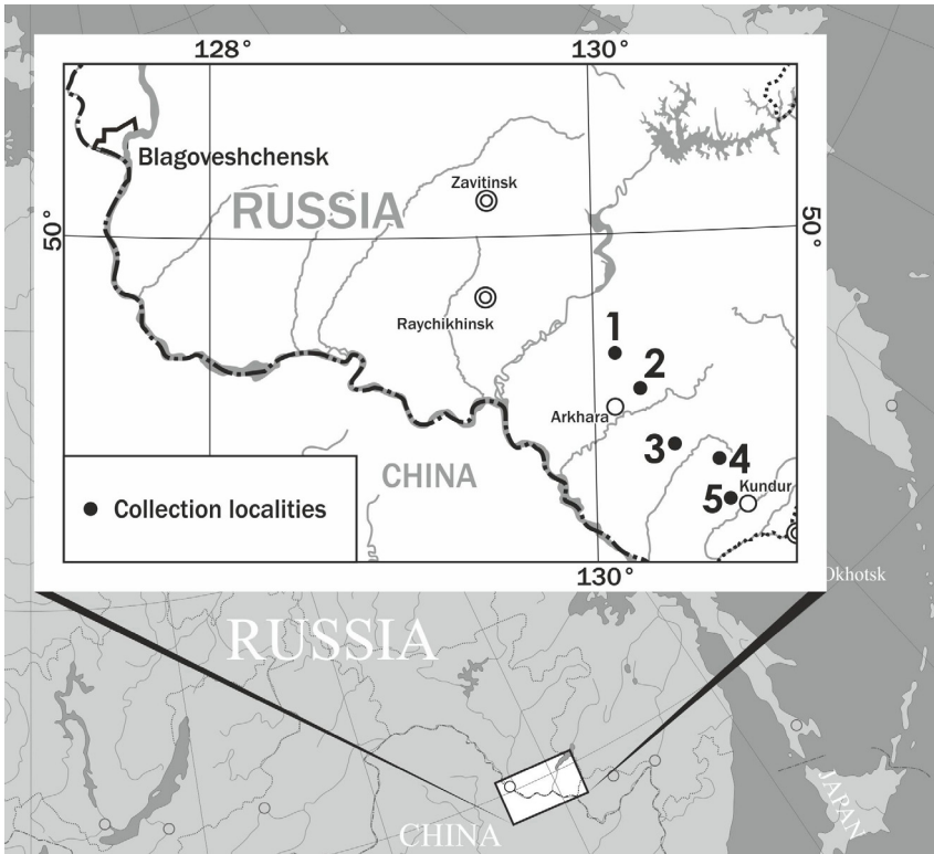
Figure 1. Map of the collection localities of Arkharinsky District of Amurskaya Oblast: 1 – valley of the river Krivoy Domikan, 2 – near Rachi railway station, 3 – near Gribovka village, 4 – near Tarmanchukan railway station, 5 – Khingan Nature Reserve, Karapcha cordon.

Larerrannis orthogrammaria (Wehrli, 1927)