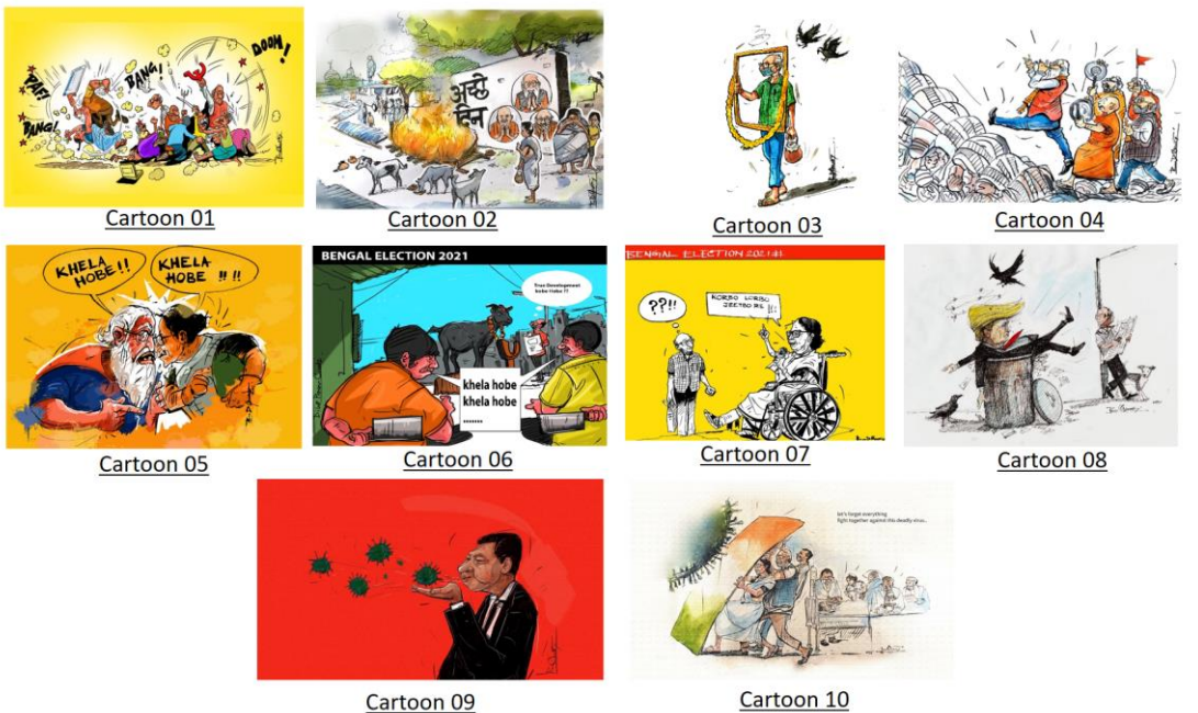
Fig. 1. Cartoons which are selected for this study.

All cartons shared in Facebook for this study is depicted in Fig.1. The author illustrated the cartoons considered in this study. The Cartoon 01 narrate the socio political chaos during Indian state election 2021. False promises of ruling Government vs exact situation were illustrate in the cartoon 02 through realistic way. The self-sufficiency and failure of Government shows in satire way through the cartoon 03. The procession of ruling political party on the death body of common people during COVID period. The cartoon 05 shows fighting of two heavy weight politician during election campaigning. During that time situation of common people, narrate through the cartoon 06. Again, the cartoon 03 shows the political drama. The cartoon 08 shows the international political situation. The cartoon 09 shows global impact of COVID-19, and cartoon 10 shows the Indian politician and common peoples fight against COVID-19. All the cartoons were shared and studied over period of 1 year (April 2020 to Mar 2021).