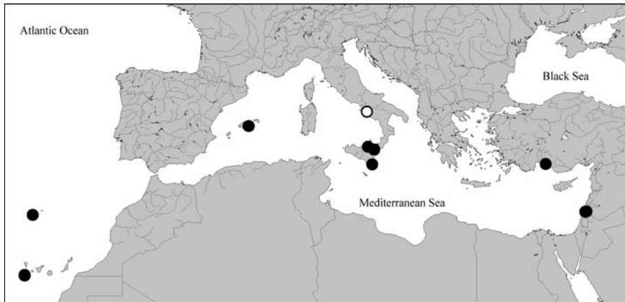
Map 1: Distribution of Atheta mucronata in the Mediterranean region and the Atlantic islands, based on revised material (filled circles) and the literature record of WHITEHEAD (2002) (open circle).

A. mucronata has been known from the Mediterranean for a long time (as A. vitalei ; see also the record in KOCH (1936)). So, there is no real evidence regarding a possible expansion of the range of the species or regarding the direction of such an expansion. The argumentation of WHITEHEAD (2002) on the distribution and possible range expansion of this species - based only on the type locality, a doubtful record (obviously referring to the record of A. dilutipennis in BERNHAUER & SCHEERPELTZ (1926), which has to be revised) and an additional record from southern Italy – lacks any basis whatsoever. Based on the records available, the high dispersal power of the species, and in view of the history of taxonomic confusion, a convincing explanation of the distribution is, at present, problematic.